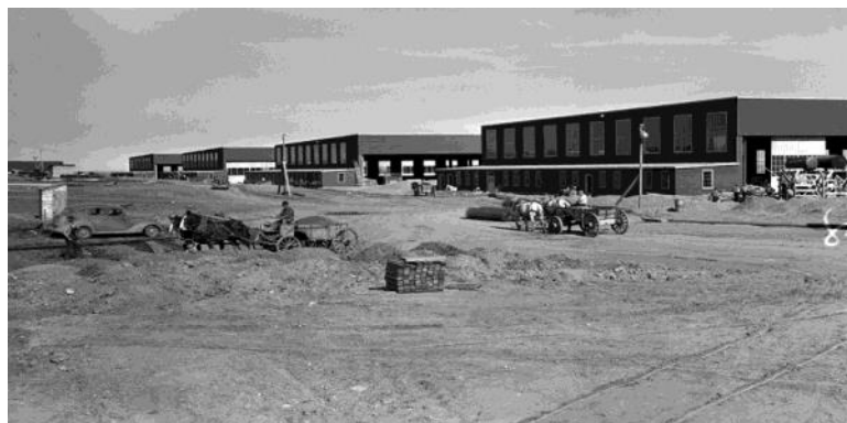
BCATP station under construction

Heating station buildings and hangars provided other engineering challenges. In Alberta, many schools were heated with natural gas, abundant in the area. In Saskatchewan, special facilities were developed for burning lignite, a local fuel of low heat value and