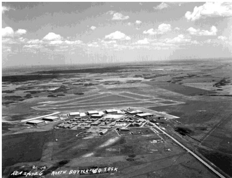
35 Service Flying Training School near North Battleford, Saskatchewan

Providing excellent fire protection equipment and constantly drilling station fire brigades paid dividends throughout the life of the Plan. Considering the material used for construction and the high fire hazards present in the hangars, it is remarkable that very little loss was accounted for by fire.