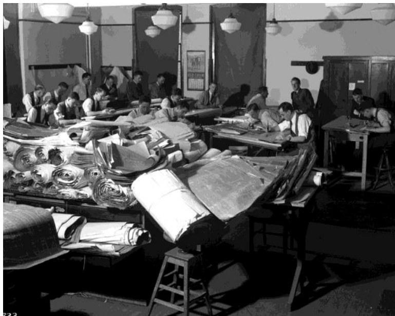
BCATP drafting office

forms of buildings – hangars, barrack blocks, offices, messes, motor pools, hospitals and drill halls – adopting a high degree of standardization. A major accomplishment was the substitution of wood for steel in the construction of the hangars. Wooden trusses spanning more than 30 meters were developed. The designs of the various types of schools were also standardized with runway layouts typically forming a triangular pattern. Tremendous pressure was brought to bear on the Directorate of Works and Buildings but there emerged an engineering and construction organization that successfully brought to completion one of the largest undertakings of its kind ever attempted.