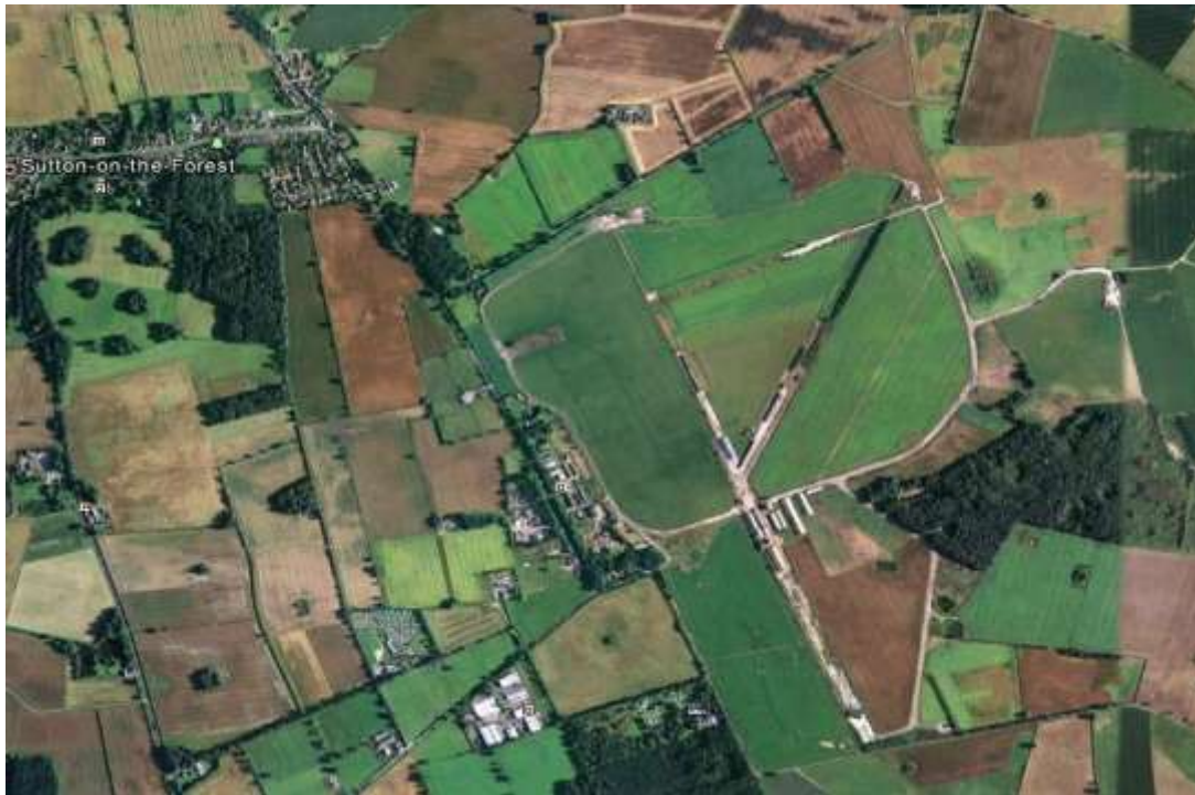
The former site of East Moor, Yorkshire Air Station