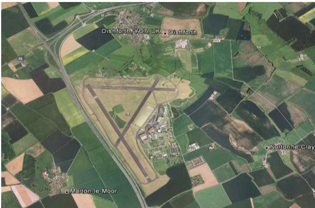
Dishforth Air Station RAF – 2009 – Runways and buildings well maintained.

(No. 425 'Allouette' Squadron transferred to No. 331 (RCAF) Wing – Tunisia, Mediterranean Air Command: 16 May 1943 to 5 November 1943 – and then returned to Dishforth on Operations with Halifax B.Mk.III aircraft in November 1943).