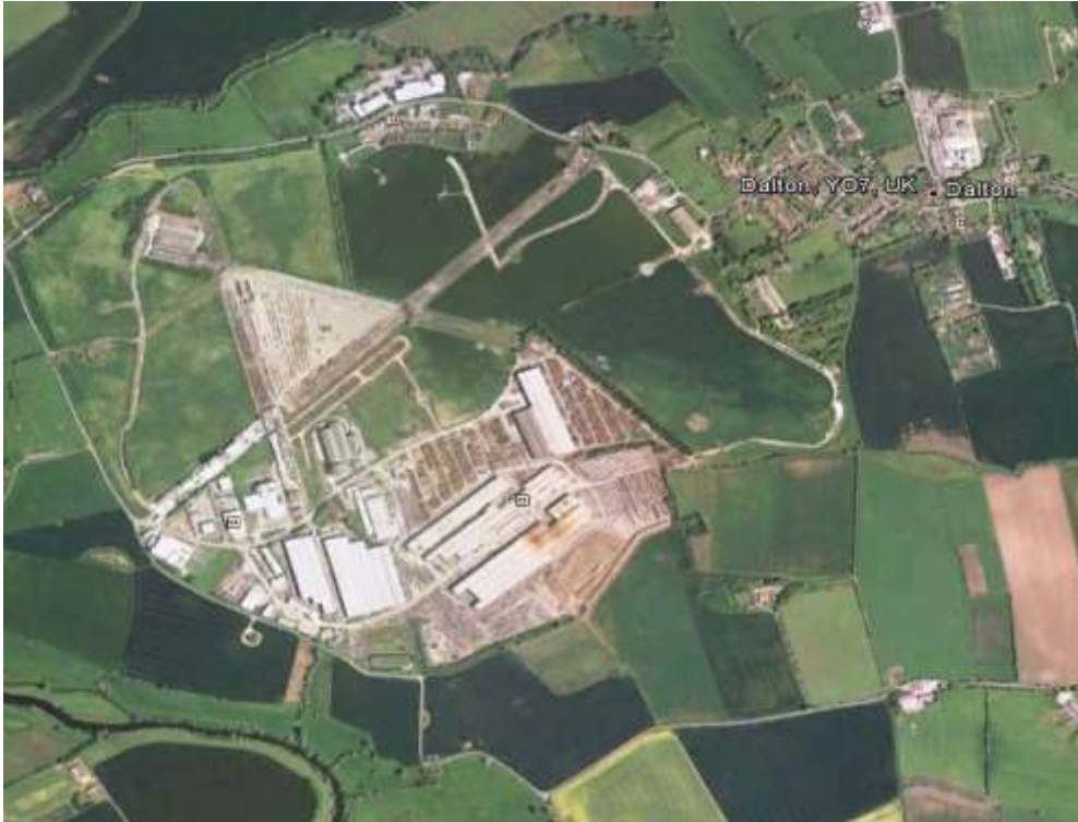
Dalton Airfield in 2009 – the runways (no longer in use), and the perimeter track are still clearly visible. Most buildings are additions from the past fifty plus years of commercial activity.

In December 1943, Dalton Air Station was transferred to No. 7 (Training Group) RAF, and no further RCAF units made use of the airfield during the remainder of the War.